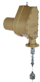
KSL-GT Withstand pressure explosion proof

Measuring tape or wire is selectable. Applicable to various size of silos (Max. measuring span 40m) Wide range of specification is available according to the applications.